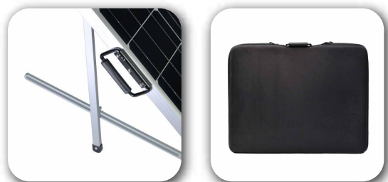
— product details —